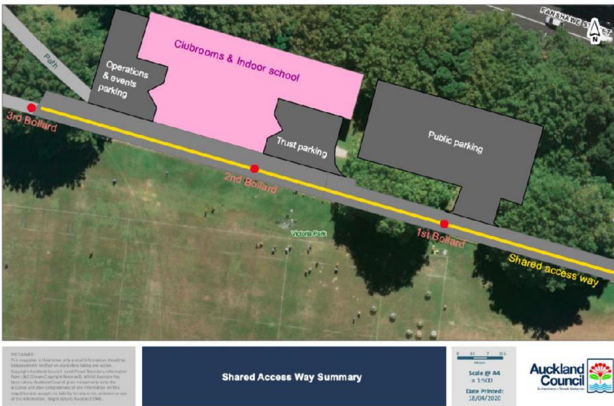
Figure 2: Aerial picture of Victoria Park shared access way and parking surrounding clubrooms.